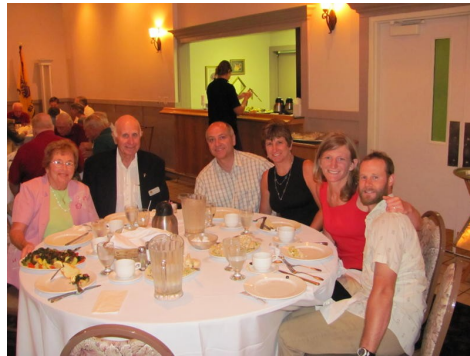
Lion Bob & Family