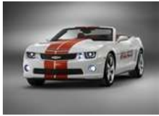
August meeting Symbol